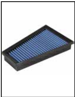
OE Replacement Air Filter