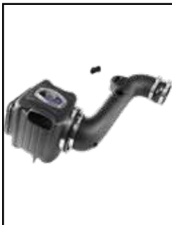
Air Intake System