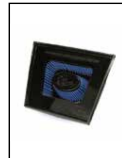
OER Air Filter

P/N: 30-80209 (P5R) 31-80209 (PDS) 73-80209 (PG7)