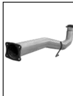
Exhaust Race Pipe