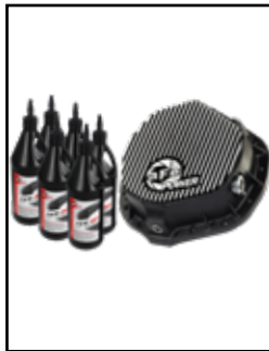
Rear Differential Cover

P/N: 46-70012-WL (w/ Oil) 46-700012 (Blk) 46-70010 (RAW)