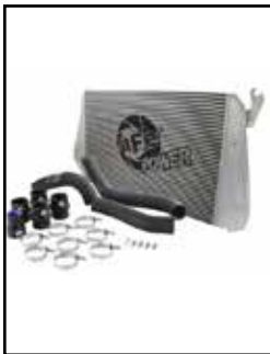
Intercooler w/ Tubes