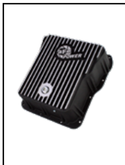
Transmission Pan Cover

P/N: 46-70012-WL (w/ Oil) 46-700012 (Blk) 46-70010 (RAW)