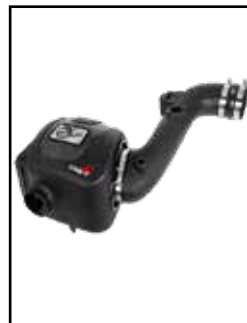
Air Intake System