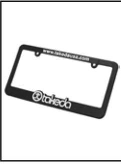
Takeda Lic. Plate Frame

P/N: 40-30332 (M) 40-30333 (L) 40-30334 (XL)