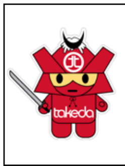
Takeda Mascot Decal