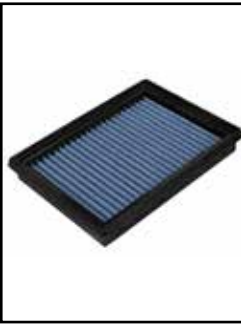
OE Replacement Filter