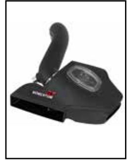
Momentum GT Intake