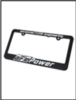
aFe Lic. Plate Frame