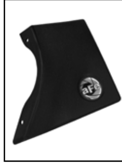
Air Intake System Cover