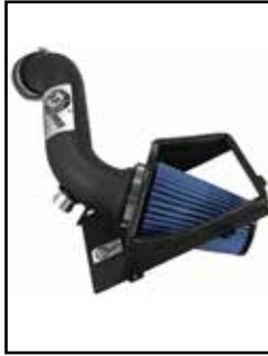
Cold Air Intake System