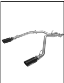
P/N : 49-42045-B