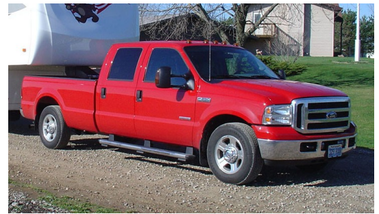
2005 & newer Ford Front

Kelderman Air Ride systems are developed for 2005 & newer Fords. This system was developed to improve the ride of the 3/4 & one-ton Ford pickups. There are several advantages to equipping your truck with air ride suspension: