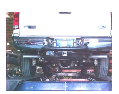
6. MEASURE 18 <sup>1</sup>/<sub>2</sub>" FROM THE REAR OF THE FRAME YOU WILL USE THIS SLOT FOR YOUR 10" HANGER #I. USE THE 3<sup>RD</sup> HOLE FROM THE TOP. USE CLAMP # H TO HOLD TAILPIPE # C TO HANGER. DO NOT TIGHTEN.

3. INSTALL BAND CLAMP # G INTO RUBBER GROMMETS LOCATED ABOVE THE REAR AXLE AND ATTACH WITH BOLT KIT #M. DO NOT TIGHTEN. INSTALL MUFFLER # B THROUGH BAND CLAMP AND ONTO HEADPIPE. USE CLAMP # L TO SECURE MUFFLER TO HEADPIPE. DO NOT TIGHTEN.