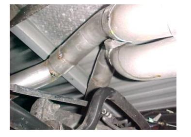
4. INSTALL DRIVERS SIDE OVER AXLE TAILPIPE # C INTO MUFLER 1 ½" TO 2" USE CLAMP # H TO SECURE PIPE TO MUFFLER. DO NOT TIGHTEN.