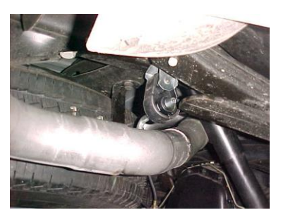
5. INSTALL PASSENGER SIDE OVERAXLE TAILPIPE # D INTO MUFFLER 1 ½" TO 2" INSERT WELDED HANGER INTO RUBBER GROMMET. USE CLAMP # H TO SECURE PIPE TO MUFFLER. DO NOT TIGHTEN.