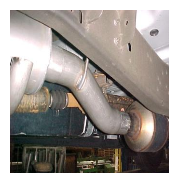
1. TO REMOVE STOCK EXHAUST UN-BOLT IT FROM THE CLAMP LOCATED JUST BEHIND THE CATALITIC CONVERTER. CUT OFF YOUR STOCK TAILPIPE AND REMOVE. LEAVE ALL RUBBER GROMMETS IN PLACE. USE WD-40 TO AID IN REMOVAL OF EXHAUST AND HANGERS.