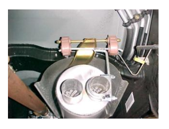
Install rear muffler Thanger #K into rubber grommets located just above the muffler outlets. Shorter side of the hanger will be inserted on the passenger side grommet. Slide clamp onto passenger side muffler outlet. Do not tighten.