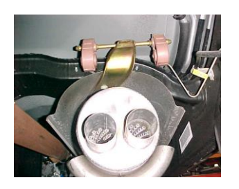
Install muffler #B onto head pipe 1 \frac{1}{2} " to 2" with the louvers facing towards the converter. Use a jack stand to support the muffler. Use clamp #J to secure the muffler to the head pipe. Do not tighten. Outlets should be on the bottom.