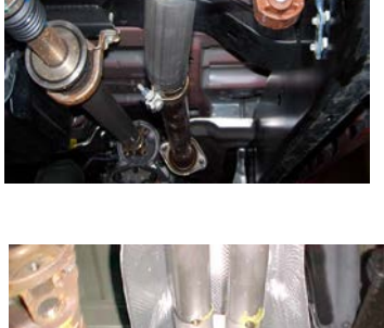
INSTALL MUFFLER # B ONTO HEADPIPE 1 1 TO 2". USE CLAMP # G TO SECURE MUFFLER TO HEADPIPE, DO NOT TIGHTEN, USE A JACK STAND TO HOLD UP THE MUFFLER. OUTLETS SHOULD BE LEVEL.