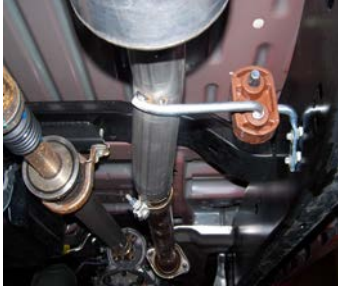
INSTALL HEADPIPE #A INTO STOCK FLANGE., ATTACH WITH BOLT KIT PROVIDED, DO NOT TIGHTEN, INSERT WELDED HANGER INTO RUBBER GROMMET.

INSTALL DRIVERS SIDE TAILPIPE # D INTO MUFFLER 1 불" TO 2". INSERT WELDED HANGERS INTO RUBBER GROMMETS. USE CLAMP # H TO SECURE PIPE TO MUFFLER, DO NOT TIGHTEN.