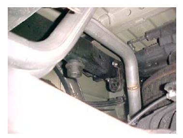
INSTALL PASSENGER SIDE TAILPIPE # C INTO MUFFLER 1<sup>1</sup>/<sub>2</sub>" TO 2". INSERT WELDED HANGER INTO RUBBER GROMMET, USE CLAMP # H TO SECURE PIPE TO MUFFLER, DO NOT TIGHTEN. ROTATE PIPE TOWARDS DRIVERSIDE.

INSTALL EXIT PIPES # E ONTO TAILPIPES. ROTATE OUT TO THE SIDES; ATTACH TO TAILPIPES WITH CLAMPS # H.