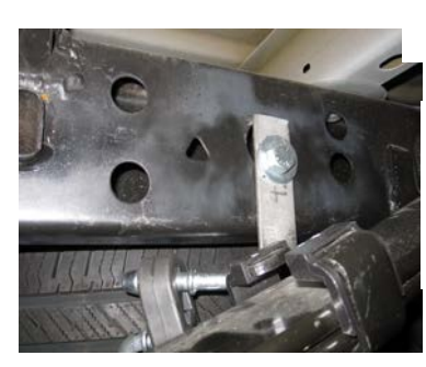
ON DRIVER SIDE: ATTACH REAR TAILPIPE HANFGER #I TO FRAME USING BOLT KIT PROVIDED