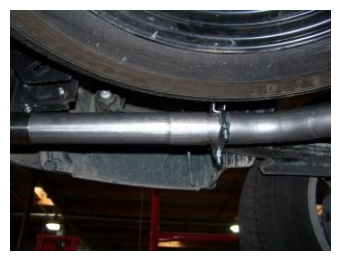
7. Install the driver side over axle tailpipe #D into the muffler 1.5-2". Use clamp #H to secure. Use another clamp #H to hold pipe up to hanger. Do not tighten. Insert welded hanger into rubber grommet.

3. Install headpipe #A onto your existing stock headpipe and attach with clamp #I. Do not tighten. Use a jack stand to support the converter.