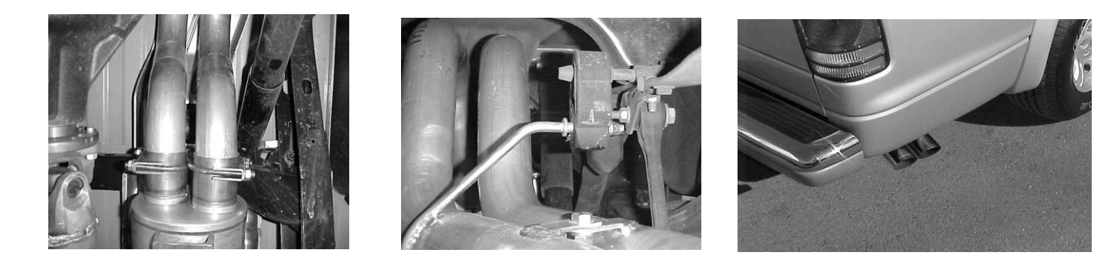
INSTALL PASSENGER OVERAXLE TAILPIPE #B INTO THE REAR OF THE MUFFLER USING CLAMP # E TO ATTACH TAILPIPE TO MUFFLER. INSTALL DRIVERSIDE OVERAXLE TAILPIPE #C. INSERT WELDED HANGER INTO RUBBER GROMMET. ATTACH HANGER TO MUFFLER. ATTACH TAILPIPES TOGETHER USING BOLT KIT # H. DRIVERSIDE TAILPIPE #C BRACKET SHOULD BE ON TOP OF PASSENGER TAILPIPE #B BRACKET. DO NOT TIGHTEN.