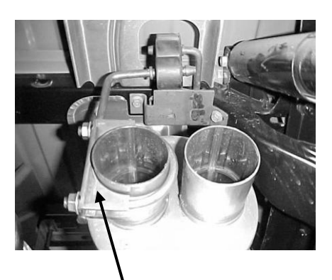
ATTACH REAR MUFFLER HANGER # F TO THE OUTLET OF THE MUFFLER ON DRIVERSIDE AND INSERT WELDED HANGER INTO GROMMET. MAKE SURE MUFFLER OUTLETS ARE LEVEL,