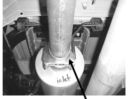
INSTALL HANGER # 6 IN FRONT OF THE MUFFLER AND INSERT INTO THE STOCK RUBBER GROMMETS. THEN INSTALL MUFFLER #B WITH INLET TOWARDS THE FRONT OF THE VEHICLE. USE A JACK STAND TO SUPPORT MUFFLER. DO NOT TIGHTEN.