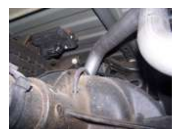
6. Install driver side tailpipe #D into muffler at least 1.5" to 2". This pipe will route over the axle and between the shock and spare tire. Use clamp #G to secure pipe to muffler. Do not tighten. Insert welded hangers into rubber grommet.