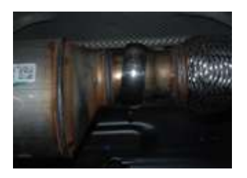
2. To remove stock exhaust, unclamp it at the ball flange behind the Y-pipe. Make sure to leave all rubber grommets in the factory location. You will re-use stock clamp. For easier removal of exhaust, cut behind the muffler. Use WD-40 to remove hangers from grommets.

1. Disconnect the negative battery cable before removal of OEM exhaust. This will allow the computer to reset and recognize the new exhaust. Lay out the exhaust on the floor so it looks like the drawing and compare parts with manual.