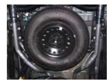
7. Install passenger side tailpipe #C into muffler at least 1.5" to 2". Use clamp #G to secure pipe to muffler. Do not tighten. The tailpipes will both lean towards the driver side for clearance. Insert welded hangers into rubber grommets.