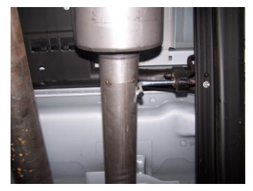
4. Slide muffler #B over headpipe 1.5-2" with the louvers facing towards the converter. Use a jack stand to support the muffler. Use clamp #E to secure the muffler to the headpipe. Do not tighten. Muffler inlet is looking into the louvers.

7. Slide the driver side over axle tailpipe #D into the muffler 1.5-2". Use clamp #H to secure tailpipe to muffler. Do not tighten. Insert welded hangers into rubber grommets.