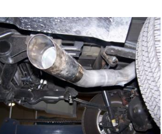
6. Slide passenger side tailpipe #C into muffler 1.5-2". Use clamp #H to secure. Do not tighten. Insert welded hangers into rubber grommets.

9. Slide each exit pipe #E onto the each tailpipe 1.5-2" and secure with clamp #H. Do not tighten. Rotate exit pipes to best suit your vehicle. It is best to adjust these pipes with the tips already on the pipes. That way you can make sure there is proper clearance.