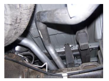
7. INSTALL PASSENGER SIDE OVER AXLE TAILPIPE #E INTO MUFFLER 11/2" TO 2" INSERT WELDED HANGER INTO RUBBER GROMMET. USE CLAMP # J TO SECURE PIPE TO MUFFLER. DO NOT TIGHTEN.