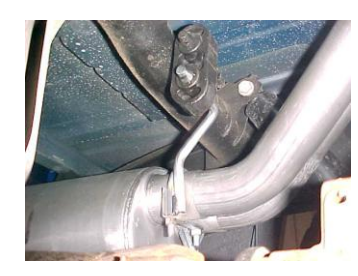
5. NEXT, INSTALL REAR MUFFLER HANGER #H ONTO DRIVER SIDE OUTLET OF THE MUFFLER. INSERT HANGER INTO RUBBER GROMMET DO NOT TIGHTEN.

9. NEXT, INSTALL EXIT PIPES #F ONTO TAILPIPES USE CLAMP # J TO SECURE EXIT PIPES TO TAILPIPES.