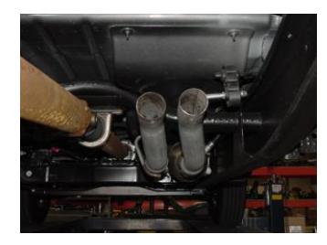
3. SLIDE PASSENGER SIDE HEADPIPE #A ONTO STOCK HEADPIPE, INSERT WELDED HANGER INTO RUBBER GROMMET. NEXT INSTALL DRIVERS SIDE HEADPIPE # B, AND USE CLAMP #I TO SECURE BOTH HEADPIPES. DO NOT TIGHTEN.