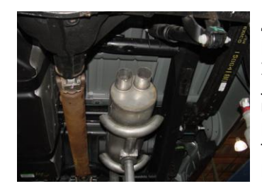
4. SLIDE MUFFLER #C ONTO HEADPIPES 1-1/2" TO 2" WITH THE INLET FACING THE MOTOR, USE A JACK STAND TO SUPPORT MUFFLER. USE CLAMPS # J TO SECURE MUFFLER TO HEADPIPES, DO NOT TIGHTEN. OUTLETS OF THE MUFFLER SHOULD BE ON THE TOP.