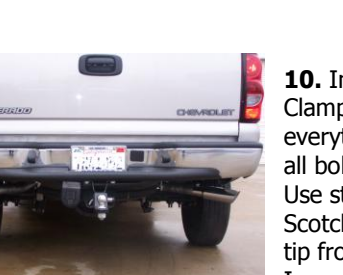
10. Install stainless steel tips. Clamp down. When you have everything in place, firmly tighten all bolts and clamps down securely. Use stainless steel cleaner and a Scotch Brite pad weekly to prevent tip from discoloration. Inspect all fasteners after 25-50 miles of operation and re-tighten as necessarv