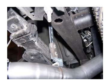
6. MEASURE 18" FROM THE REAR OF THE FRAME TOWARDS THE FRONT OF THE VEHICLE. USE THIS SLOT FOR THE 10" HANGER #K, INSTALL USING THE 1ST HOLE USE HARDWARE KIT #L.