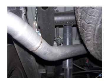
8. INSTALL DRIVER SIDE OVER AXLE TAILPIPE #D INTO THE MUFFLER. 11/2" TO 2" ROTATE PIPE UNTIL IT HITS THE 10"HANGER USE CLAMP # K TO HOLD UP THE PIPE, ATTACH TAILPIPE TO MUFFLER USING CLAMP # H. DO NOT TIGHTEN.