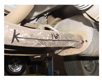
2. TO REMOVE STOCK EXHAUST, CUT 16" FROM THE FRONT OF THE MUFFLER FORWARD TOWARDS THE FRONT OF THE VEHICLE. LEAVE ALL RUBBER GROMMETS ON THE HANGER. USE WD-40 TO AID IN THE REMOVAL OF EXHAUST AND HANGERS.

Disconnect the negative battery cable before removal of OEM exhaust. This will allow the computer to reset and recognize the new exhaust. Lay out the exhaust on the floor so it looks like the drawing and compare parts with manual.