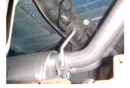
INSTALL YOUR STAINLESS TIPS TO YOUR DESIRED LOOK TIGHTEN ALL CLAMPS FROM THE FRONT, WORKING YOUR WAY BACK.