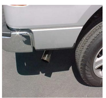
INSTALL YOUR STAINLESS TIP TO YOUR DESIRED LOOK. NOW GO BACK AND TIGHTEN ALL CLAMPS STARTING FROM THE FRONT AND WORKING YOUR WAY BACK.