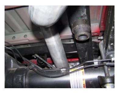
INSTALL OVERAXLE TAILPIPE #C INTO MUFFLER 1 ½" TO 2". INSERT HANGERS INTO RUBBER GROMMETS.USE CLAMP #E TO SECURE PIPE TO MUFFLER.DO NOT TIGHTEN.