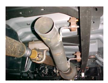
2. Install headpipe #A onto your catalytic converter and attach with clamp #H. Use a jack stand to support the converter. DO NOT TIGHTEN. Insert welded hangers into rubber grommets.

5. Install the over axle tailpipe #C into the muffler 1\frac{1}{2}-2^{"} and secure with clamp #G. DO NOT TIGHTEN.