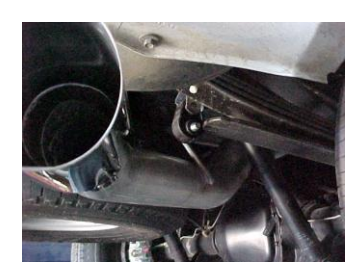
7. Install the exit pipe #D onto the over axle tailpipe and secure with clamp #G. DO NOT TIGHTEN. Insert welded hanger into rubber grommet