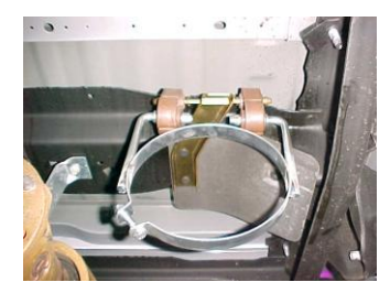
3. Install band clamp #F into rubber grommets located above the axle and attach bolt kit #I. DO NOT TIGHTEN.

6. Remove the spare tire. On the passenger side rotate the bracket that holds the spare tire 180 degrees and re-install spare tire.