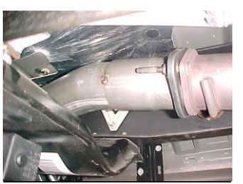
6. Re-install your catalytic converter to the new downpipe using your stock nuts and bolts. DO NOT TIGHTEN.

3. To remove the downpipe unclamp it from the turbo housing and remove through the bottom of the vehicle. Do not discard or damage the stock clamp you will re-use it to install the new downpipe.