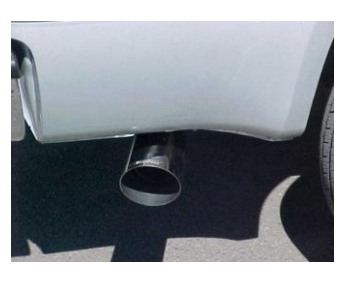
8. Install stainless steel tip #E. Clamp down. When you have everything in place, firmly tighten all bolts and clamps down securely. Use stainless steel cleaner and a Scotch Brite pad weekly to prevent tip from discoloration.

GIBSON EXHAUST systems are designed on a factory stock vehicle. Any aftermarket products installed could increase the sound levels of this Exhaust. Make sure there is a 1" clearance from ALL rubber brake lines, shock boots, fuel lines, tires, etc to prevent heat related damage or fire.