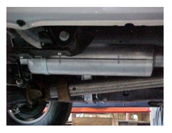
4. Install muffler #B onto headpipe 1½-2" with the louvers facing the converter. Secure with clamp #G. DO NOT TIGHTEN. Use a jack stand to support the muffler.