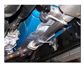
2. Install head pipe #A onto your existing stock front pipe and attach with hardware kit #F. DO NOT TIGHTEN. Insert welded hangers into rubber grommets.

4. Install the overaxle tailpipe #C into the muffler 1½-2" secure with clamp #E. DO NOT TIGHTEN. Insert welded hanger into rubber grommet.