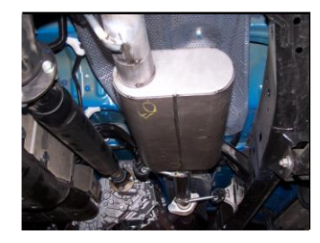
3. Install muffler #B onto head pipe 1½"-2" with the louvers facing towards the converter. Use a jack stand to support the muffler. Use clamp #E to secure the muffler to the headpipe. DO NOT TIGHTEN.

6. Check for all proper clearance and begin to tighten all clamps starting from the front of the vehicle. Before starting the engine be sure there is a 1" clearance from all exhaust parts.