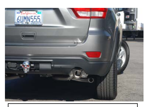
6. With the Exhaust installed and tight clean your Stainless steel tips so that all finger prints have been removed and enjoy your new performance exhaust.

"MAKE SURE YOU HAVE A 1" CLEARANCE ON ALL PIPES FROM ALL RUBBER BRAKE LINES, SHOCK BOOTS, TIRES, ETC..." TORQUE ALL CLAMPS TO APPROX. 100 TO 150 FT LBS.