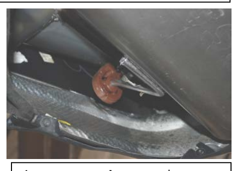
4. Be sure hanger is correctly installed into the rubber grommet for complete support.