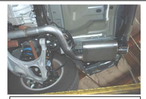
3. Install the driver side muffler assembly onto the factory pipe. and into the factory rubber grommets. Do not tighten.