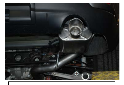
5. With the muffler assembly in place align the tip so it is centered in the exhaust outlet. You may need to use something like a rag to hold the tips in place while the clamp is being tightened.