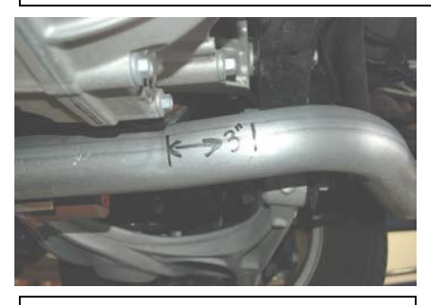
2. To remove the factory exhaust measure from the rear bend 3" forward. Please reference picture for location. Mark and cut with a hack saw or cut off wheel. Leave the factory rubber grommets in place they will be reused.

1. Disconnect the negative battery cable before removal of the OEM Exhaust. This will allow the computer to reset and recognize the new exhaust. Lay out the exhaust on the floor so it looks like the drawing and compare parts with manual. Be sure all part numbers and your vehicle model match the instruction manual before removing your factory exhaust.