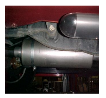
INSTALL MUFFLER # C ONTO YOUR RESONATOR 1 ½" –2". USE CLAMP # G TO SECURE MUFFLER TO THE PIPE, DO NOT TIGHTEN.

INSTALL EXTENSION PIPE #I ONTO HEADPIPE. INSERT WELDED HANGER INTO GROMMET. USE CLAMP #G TO SECURE. DO NOT TIGHTEN.