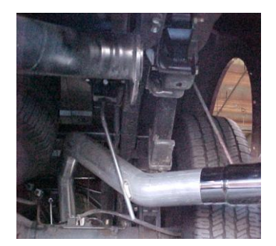
INSTALL OVERAXLE TAILPIPE # D INTO MUFFLER 1 ½"-2" INSERT WELDED HANGER INTO RUBBER GROMMET USE CLAMP # G TO SECURE PIPE TO MUFFLER.