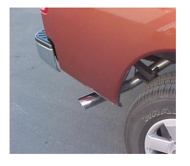
INSTALL YOUR STAINLESS TIP TO YOUR DESIRED LOOK. NOW GO BACK AND TIGHTEN ALL YOUR FLANGES, CLAMPS, ETC. STARTING FROM THE FRONT AND WORKING YOUR WAY BACK. TO CLEAN YOUR STAINLESS TIP USE A STAINLESS CLEANER AND A SCOTCH BRITE PAD. AFTER 20-25 MILES CHECK AND RETIGHTEN ALL FASTENERS IN NESERSARY.

INSTALL EXTENSION PIPE #I ONTO HEADPIPE INSERT WELDED HANGER INTO RUBBER GROMMET USE CLAMP #G TO SECURE. DO NOT TIGHTEN.