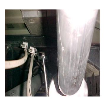
INSTALL BAND CLAMP # F ONTO MUFFLER, INSERT HANGER INTO RUBBER GROMMET, USE BOLT KIT PROVIDED, DO NOT TIGHTEN.