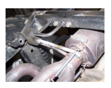
7. To install your Gibson exhaust, first install your header. Re-use the stock nuts to bolt the flanges onto the head. Do not tighten the bolts until the complete system is installed.

6. Next, unbolt the 2 flanges at the head and remove header. Do not throw away stock nuts, you will re-use them. (Lay the stock header sideways in front of sway bar and brake caliper in order to have room to slide the stock muffler out.)