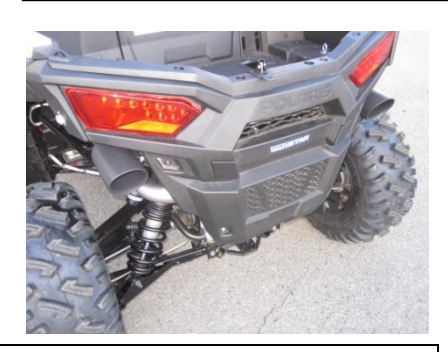
7. Once everything has been installed Double Check all connections install your exhaust tips. Be sure there is a 1" clearance from all major components. Then go have fun.

"MAKE SURE YOU HAVE A 1" CLEARANCE ON ALL PIPES FROM ALL RUBBER BRAKE LINES, SHOCK BOOTS, TIRES, ETC..."