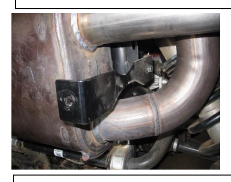
5. Install the provided heat shield bracket's into the factory locations re using the factory bolts to attach it to the frame on both driver and passenger sides.