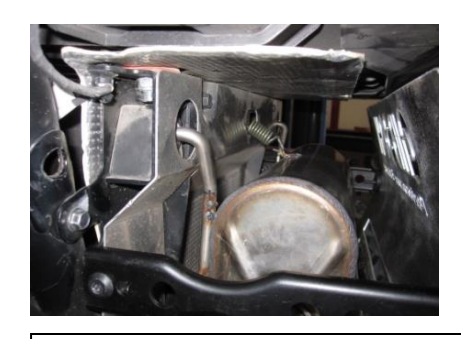
3. Next install the Gibson Muffler assembly. Install the bottom hanger mounts first then slide the inlet over the factory head pipe re using the factory gasket and springs.