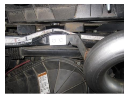
4. With the springs installed and the exhaust in the desired position mark the holes on the frame for the tailpipe hangers. You can either drill the holes and through bolt or use the provided self tapping screws.