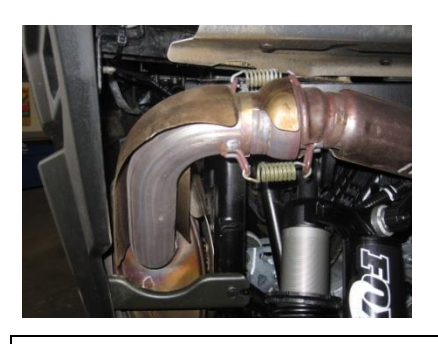
2. Once you have removed the factory plastics off the rear now you can remove your factory exhaust.

1. Disconnect the negative battery cable before removal of the OEM Exhaust. This will allow the computer to reset and recognize the new exhaust. Lay out the exhaust on the floor so it looks like the drawing and compare parts with manual. Remove the factory exhaust by un bolting the factory rear plastic valance You will re use the hardware for the Gibson install. Dis-connect the 4 factory springs and remove the factory exhaust. Do not damage the factory exhaust gasket and springs. You will re use this gasket and springs.