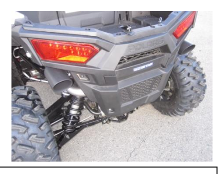
7. Once everything has been installed Double Check all connections install your exhaust tips. Be sure there is a 1" clearance from all major components. Then go have fun.

"MAKE SURE YOU HAVE A 1" CLEARANCE ON ALL PIPES FROM ALL RUBBER BRAKE LINES, SHOCK BOOTS, TIRES, ETC..."