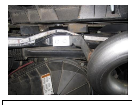
4. With the springs installed and the exhaust in the desired position mark the holes on the frame for the tailpipe hangers. You can either drill the holes and through bolt or use the provided self tapping screws.