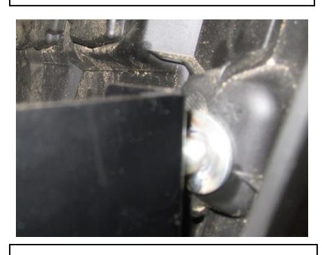
6. With all brackets in place and muffler completely installed begin re installing the rear heat shield and factory cover. You will install the heat shield with the bolt holes at the bottom closest to the muffler. The provided spacers will be placed between the heat shield and factory cover.