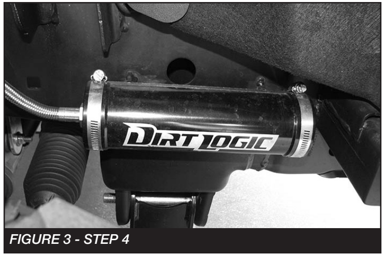
FIGURE 3 - STEP 4