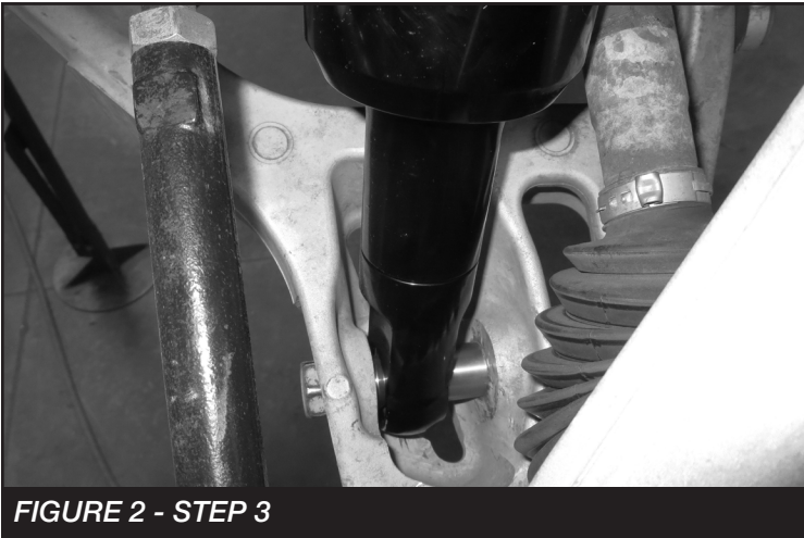
FIGURE 2 - STEP 3