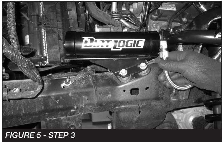
FIGURE 5 - STEP 3