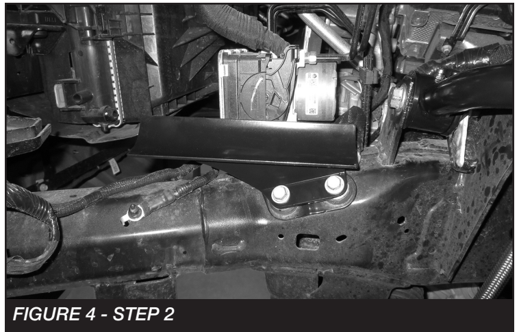
FIGURE 4 - STEP 2