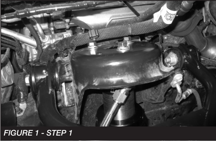
FIGURE 1 - STEP 1