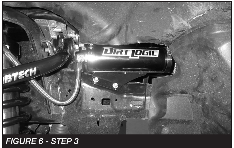
FIGURE 6 - STEP 3