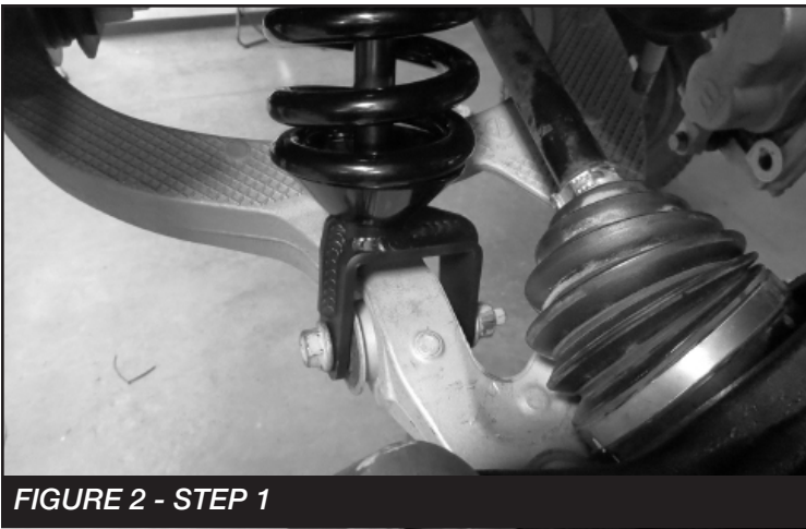
FIGURE 2 - STEP 1