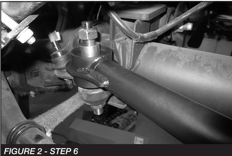
FIGURE 2 - STEP 6