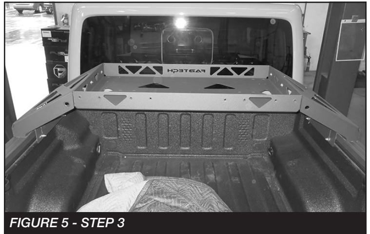
FIGURE 5 - STEP 3