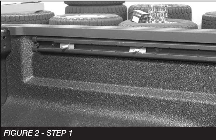
FIGURE 2 - STEP 1