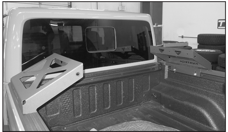
FIGURE 4 - STEP 2