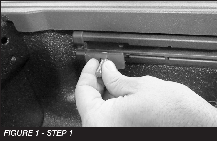
FIGURE 1 - STEP 1