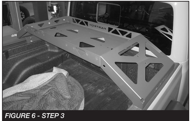
FIGURE 6 - STEP 3