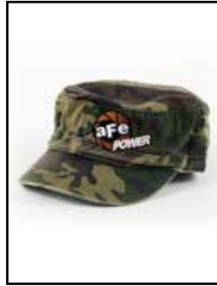
aFe Power Ladies Hat

P/N: 40-10114 (S/M) P/N: 40-10115 (L/XL)