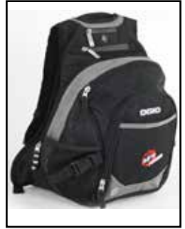
aFe Power Backpack