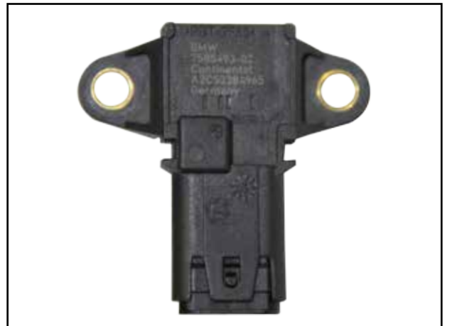
Sensor Style 1 TMAP Sensor

The 2009-2012 BMW's with the N63 engine came with two styles of TMAP sensors depending on your vehicles build date. Please use the photos below to confirm which style sensors your vehicle is equipped with and confirm you have the correct module. The breaking year is 2011. Vehicles before mid 2011 have the sensor 1 style. Vehicles after mid 2011 have the sensor 2 style