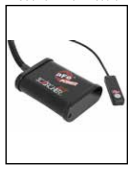
P/N: 77-46321 (Sensor 2)