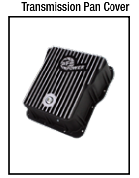
P/N: 46-70072 (Blk) 46-70070 (RAW)