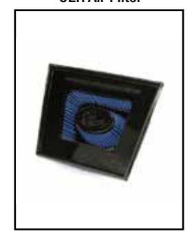
P/N: 30-80209 (P5R) 31-80209 (PDS) 73-80209 (PG7)