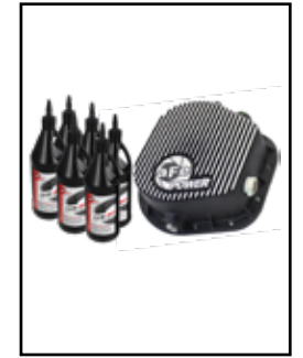
P/N: 46-70022-WL (w/ 0il) 46-70022 (Blk) 46-70020 (RAW)