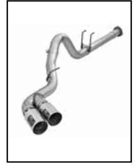
P/N: 49-43102-B (Blk. Tips) 49-43102-P (Pol. Tips)