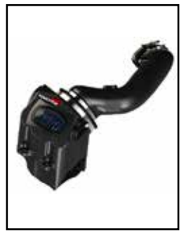
P/N: 50-73006 (P10R) 51-73006 (PDS)