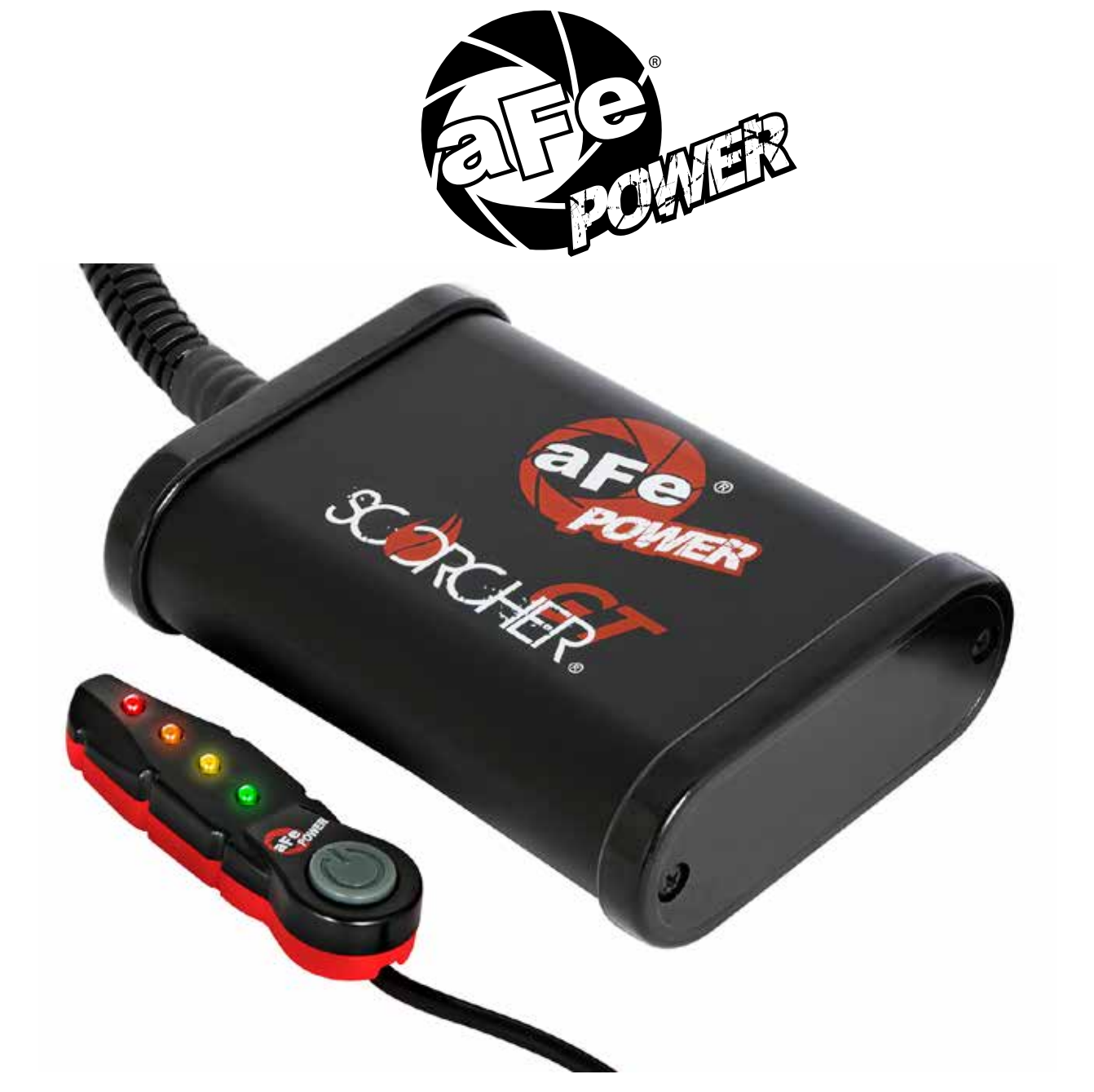
advanced FLOW engineering Instruction Manual P/N: 77-46102

Make: Nissan Model: GT-R (R35) Year: 2009-2019 Engine: V6-3.8L Twin-Turbo