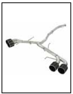
P/N: 49-36108-C (C/F Tips) 49-36108-P (Pol. Tips)