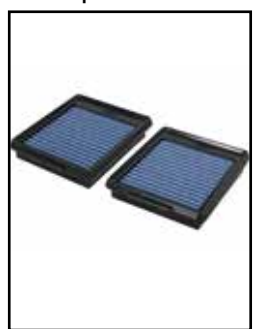
P/N: 30-10166 (P5R) 31-10166 (PDS)