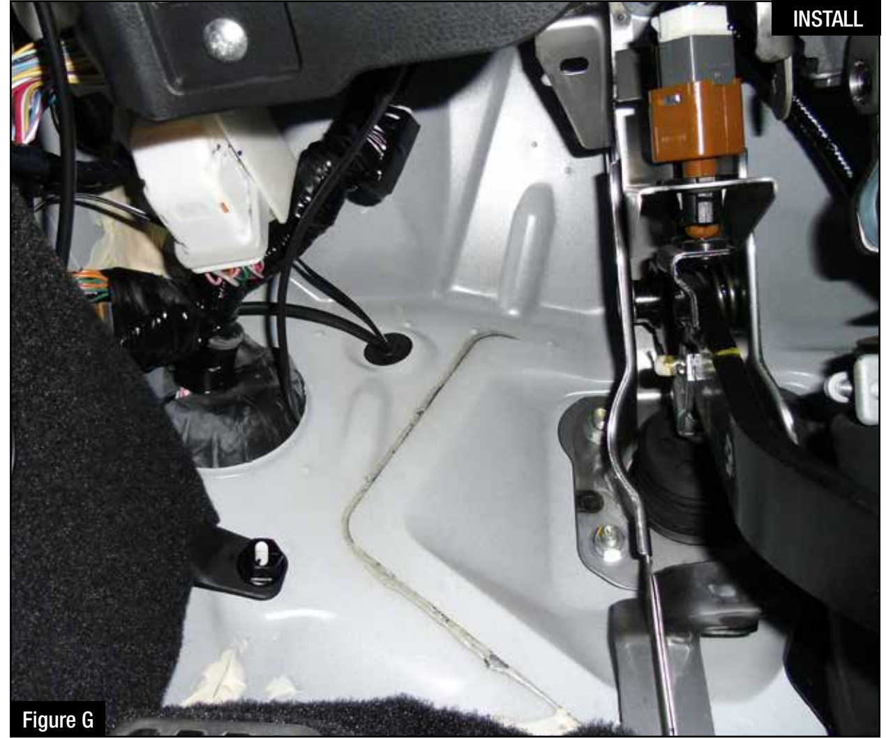
Refer to Figure G for Step 12.

Step 12: Route the switch cable through firewall and into the engine bay. Follow the main harness through the grommet into the firewall. Plug the end of the cable to the module.