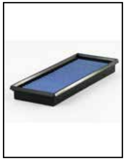
P/N: 30-10181 (P5R) 31-10181 (PDS)