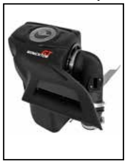
P/N: 54-76402 (P5R) 51-76402 (PDS)