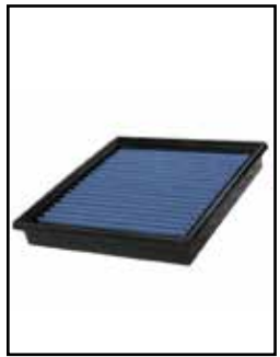
P/N: 30-10225 (P5R) 31-10225 (PDS)