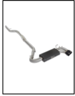
P/N: 49-36329-B (Blk Tip) 49-36329-P (Pol Tip)