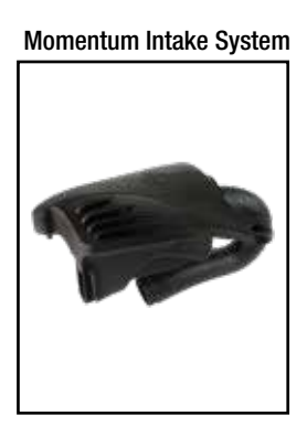
P/N: 54-82212 (P5R) 51-82212 (PDS)