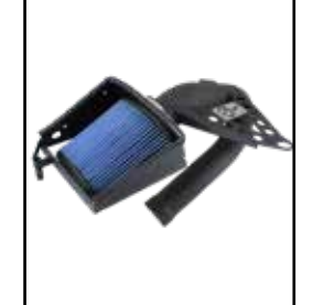
P/N: 51-12212 (PDS) 54-12212 (P5R)