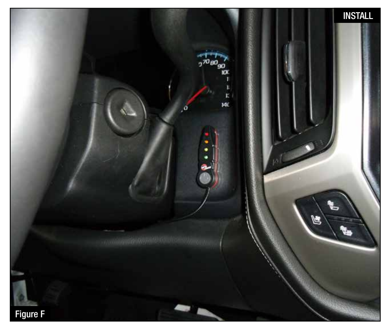
Refer to Figure F for Steps 9-10.

Step 9: Mount the Switch on an open, flat surface.