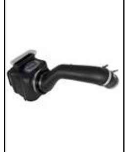
P/N: 50-74008 (P10R) 51-74008 (PDS)