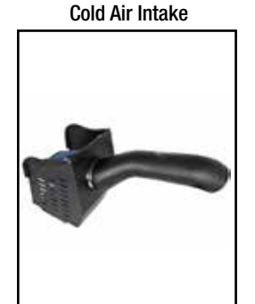
P/N: 51-12902 (PDS) 54-12902 (P5R)