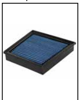
P/N: 30-10275 (P5R) 31-10275 (PDS)