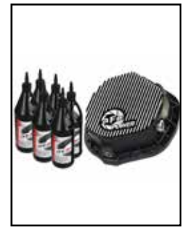
P/N: 46-70012-WL (w/ 0il) 46-70010 (RAW)