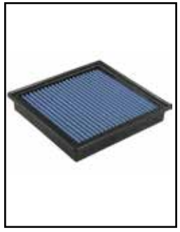
P/N: 30-10162 (P5R) 31-10162 (PDS)