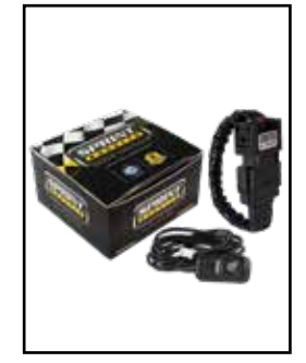
P/N: 77-13001 (A/T)