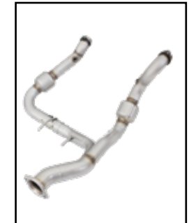
P/N: 48-43008 (Street) 48-43009 (Race)