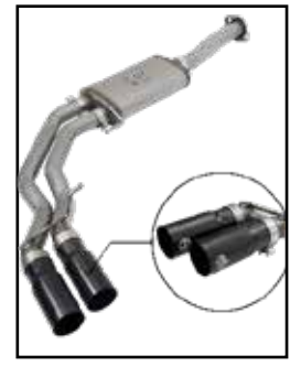
P/N: 49-43081-B (Blk Tips) 49-43081-P (Pol Tips)