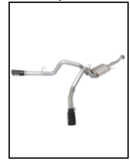
P/N: 49-43070-B (Blk Tips) 49-43070-P (Pol Tips)