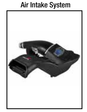
P/N: 51-73112 (PDS) 54-73112 (P5R)