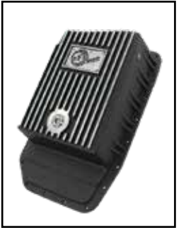
P/N: 46-70172 (Black) 46-70170 (RAW)