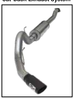
P/N: 49-43069-B (Blk Tip) 49-43069-P (Pol Tip)