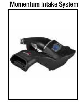
P/N: 51-73112 (PDS) 54-73112 (P5R)