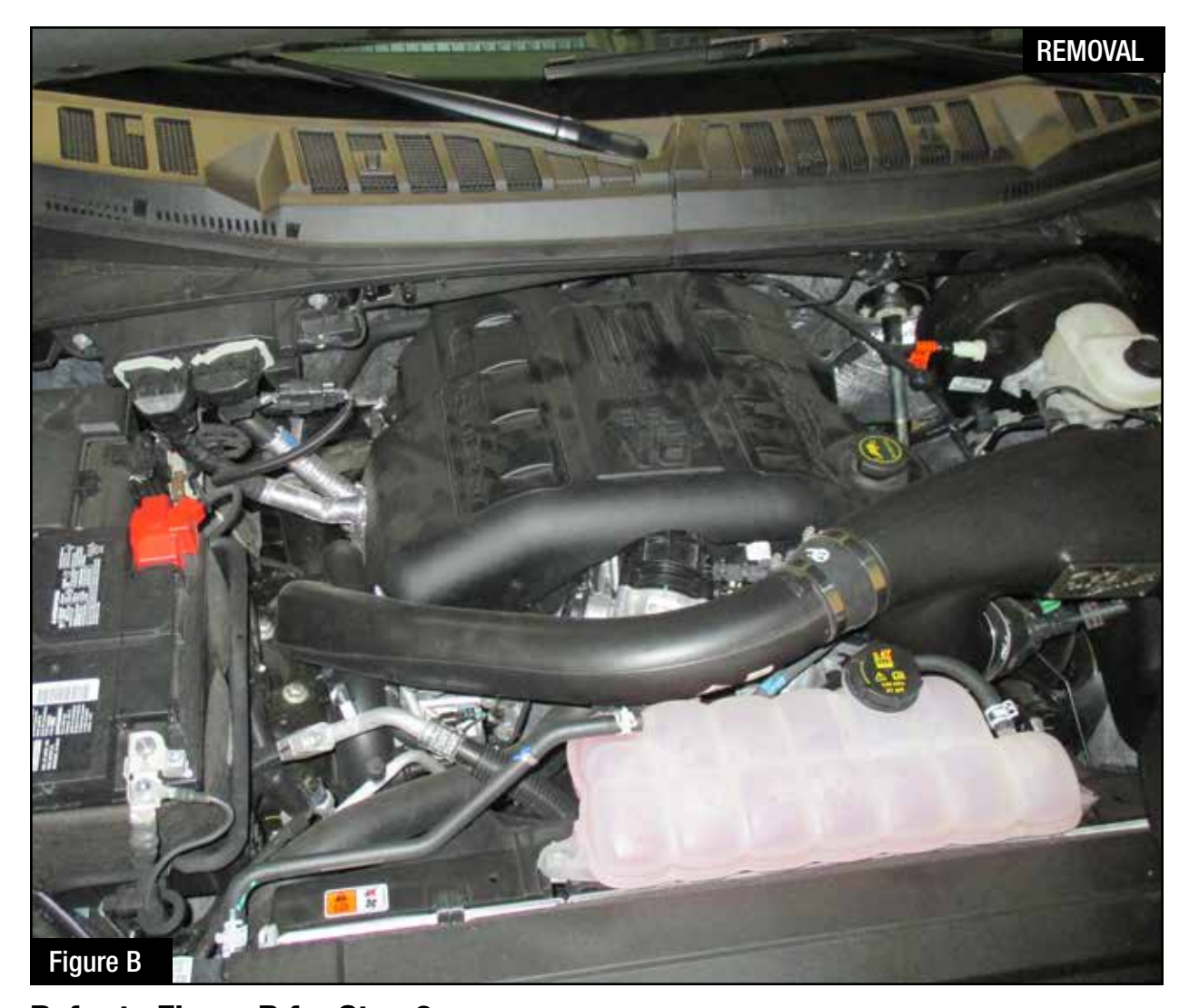
Refer to Figure B for Step 2.

Step 2: With a pulling motion remove the engine cover out of the vehicle.