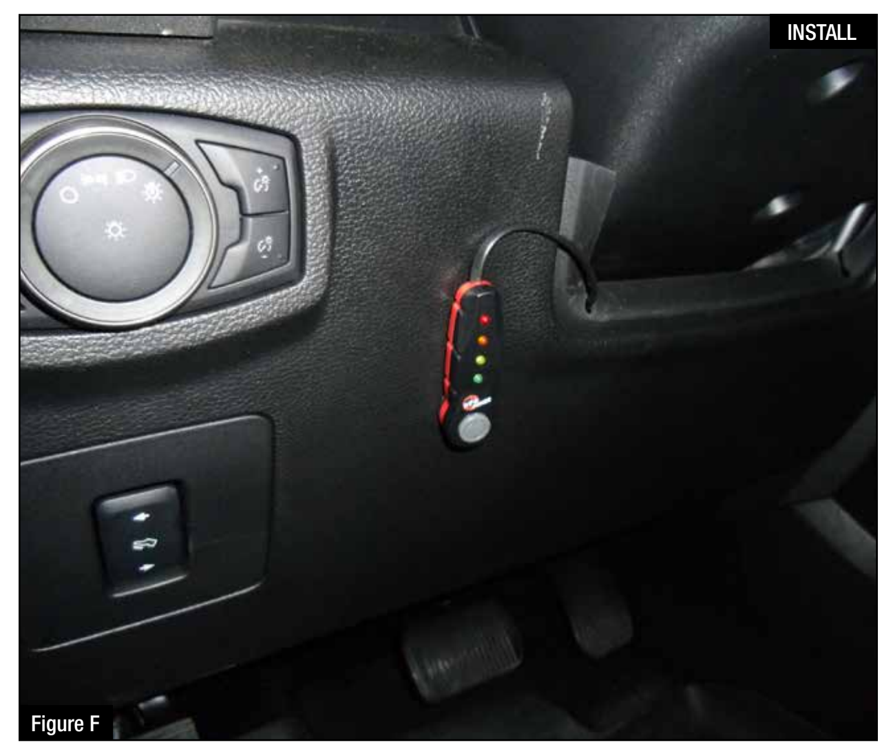
Refer to Figure F for Steps 8-9.

Step 8: Carefully rout the switch cable behind steering wheel cover.