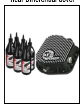
P/N: 46-70152-WL (w/ 0il) 46-70152 (Blk) 46-70150 (RAW)