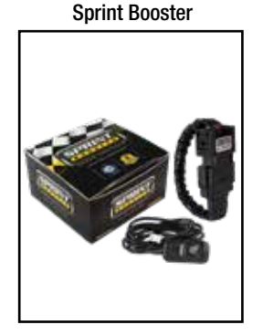
P/N: 77-13001 (A/T)