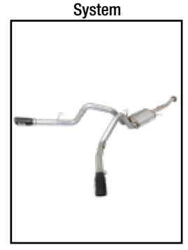
P/N: 49-43070-B (Blk Tip) 49-43070-P (Pol Tip)