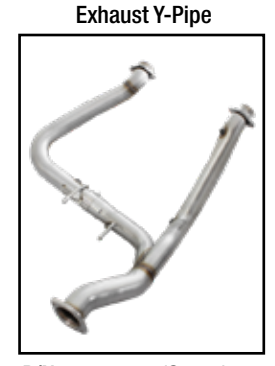
P/N: 48-43012 (Street) 48-43011 (Race)