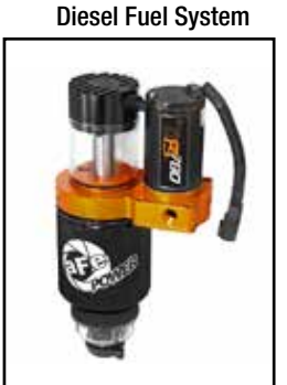
P/N: 42-13031 (Full-time) 42-13032 (Part-time)