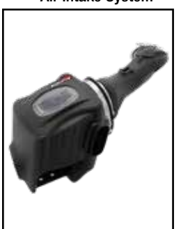
P/N: 50-73004 (P10R) 51-73004 (PDS) Diesel Fuel System