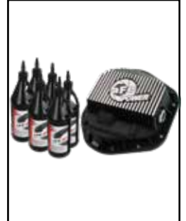
P/N: 46-70082-WL (w/ 0il) 46-70082 (Blk) 46-70080 (RAW)