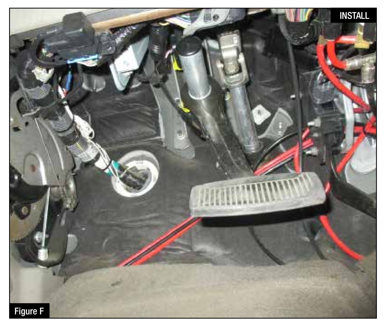
Refer to Figure F for Step 9.