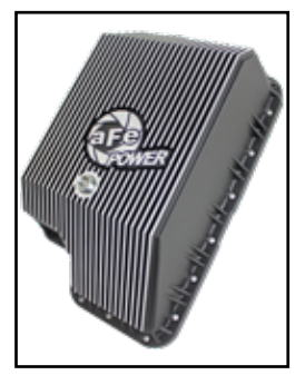
P/N: 46-70122 (Blk) 46-70120 (RAW)