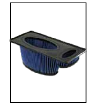
P/N: 10-10107 (P5R) 11-10107 (PDS) 71-10107 (PG7)