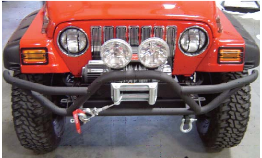
FIGURE 1 Installed Trailblazer Front Bumper Tow accessories sold separately