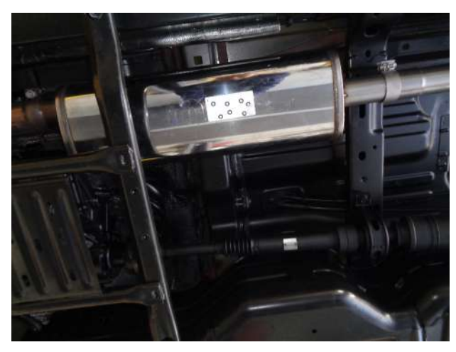
Step 2. To begin, fasten the Inlet pipe assembly to the outlet of the OE system using the OE clamp assembly and by fitting the welded hanger into the rubber insulator (Leave all clamps and fasteners loose for final adjustment of the complete system.)