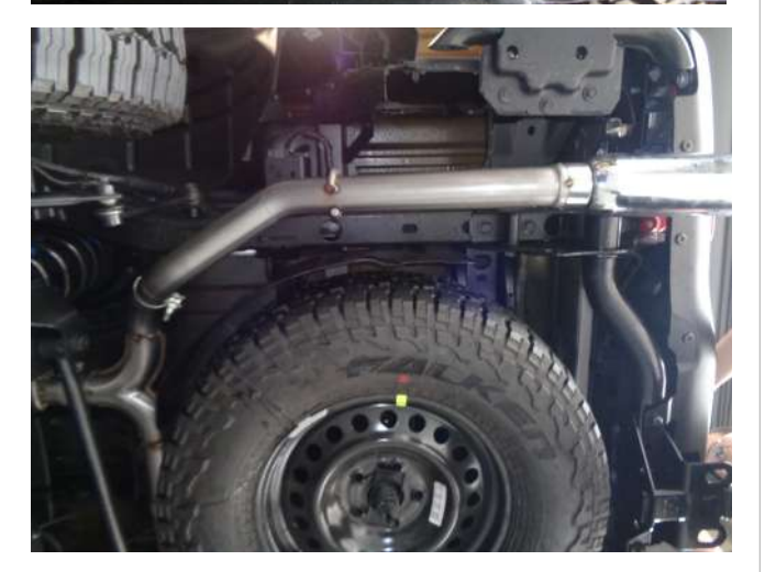
Step 4. Next loosely attach the Driver Side Tailpipe to the Y-Pipe by using the hanger brackets and the supplied 2.50" clamp.