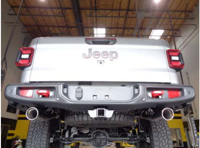
Step 7. Once a final position has been chosen for the new exhaust system, evenly tighten all clamps from front to rear using the torque specifications on page one of the instructions. Inspect all fasteners after 25-50 miles of operation and re-tighten if necessary.