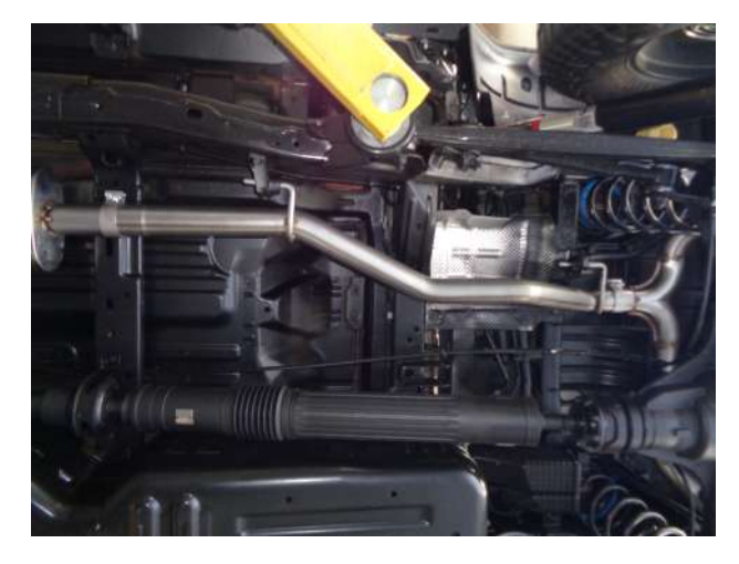
Step 3. Install this to the Inlet Pipe Assembly using the supplied 3.00" clamp and attaching the hangers, then attach the Y-Pipe Assembly to the Extension Pipe.