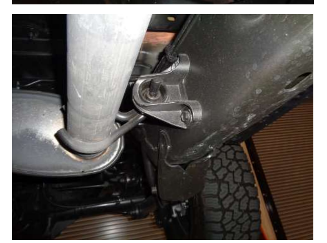
Step 1. To remove the OEM exhaust system, you will to need to remove the spare tire first. You can then disengage the welded hangers from the rubber insulators and remove the tailpipe assy. Unfasten the clamp attaching the OEM inlet pipe assembly to the catalytic converter. Do not damage or discard the inlet pipe clamp or rubber insulators as they will be re-used to mount the new system. Disengage the inlet pipe assembly hanger and remove the exhaust from the vehicle.