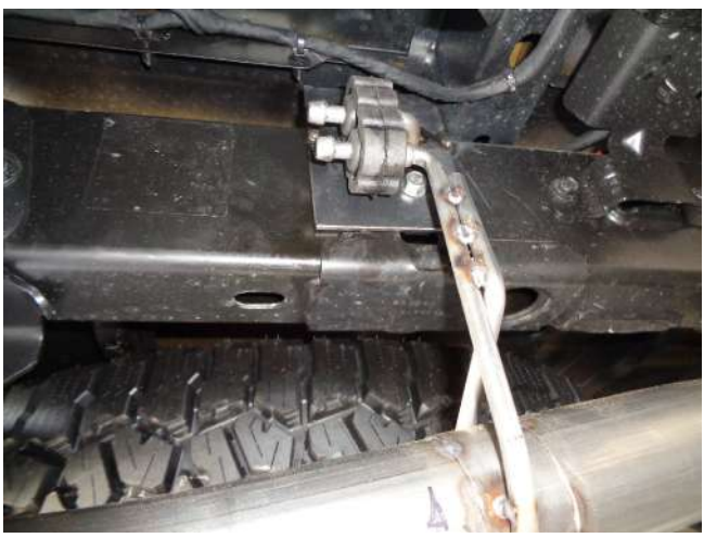
Step 5. As this vehicle was not setup for dual exhaust from the factory, a hanger bracket will need to be installed to the frame on the Passenger side with the supplied hardware as shown. Use the supplied zip tie to move the breather tube out of the way.