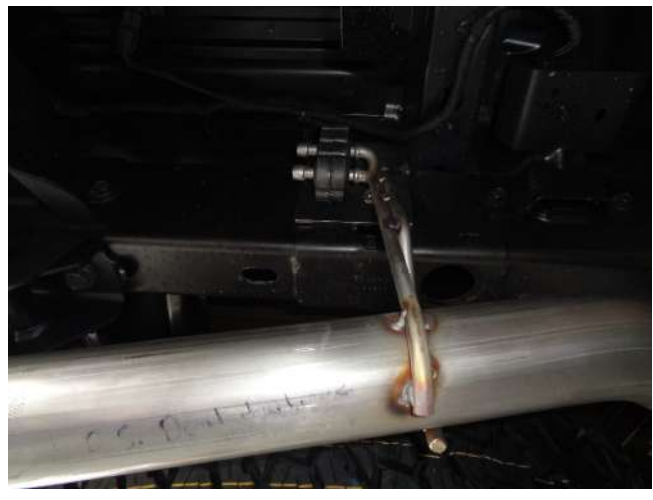
Step 6. Next loosley attach the Passenger Side Tailpipe to the Y-Pipe by using the hanger brackets and the supplied 2.50" clamp.