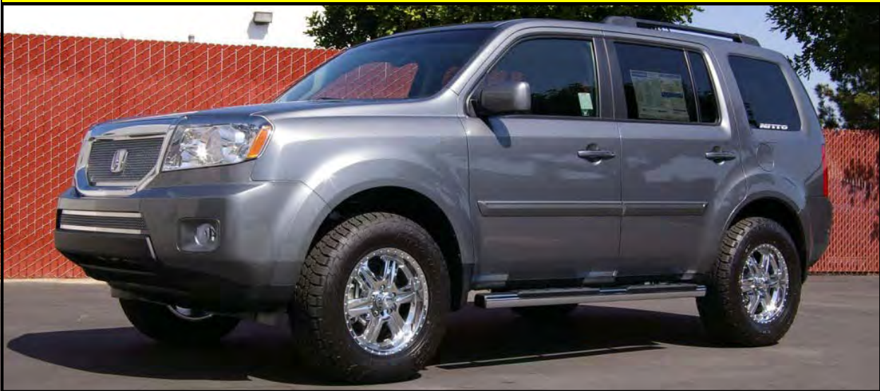
After ReadyLift® 69-8020 SST Lift kit. 265/65R17 Nitto Terra Grapplers on 17x8.5 +30 offset AR Fuel. Minor trimming needed.

*It is also recommended that you adjust your headlights whenever your vehicle's ride height is altered.