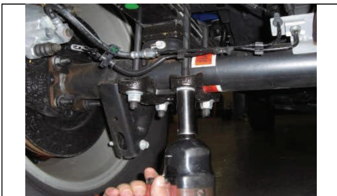
Loosen and remove factory u-bolt hardware.