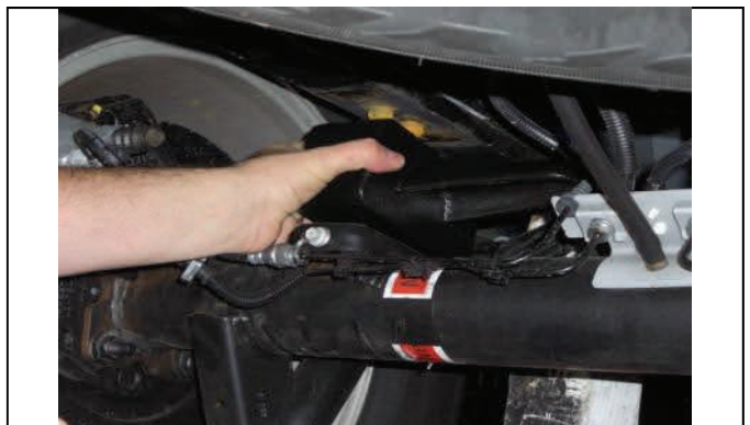
Install lift block with centering pin toward axle.