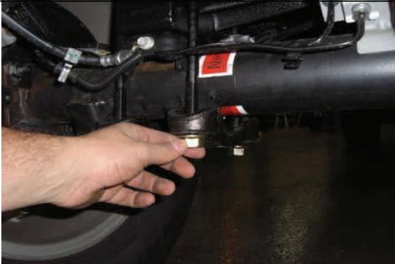
Place lower spring plate onto u-bolts and attach w/ new nuts.