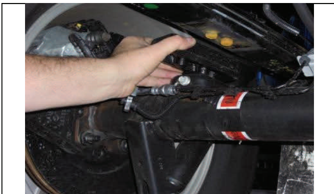
4WD only: Lower axle enough to remove factory block.