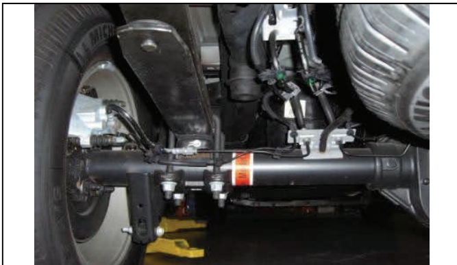
View of 2WD rear axle and leaf springs.