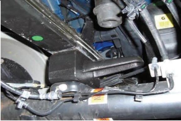
Raise axle and center on locating pins in leaf spring.