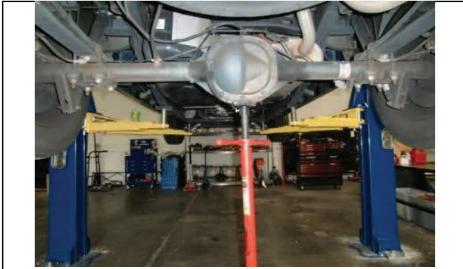
Raise vehicle at frame and support axle with jack