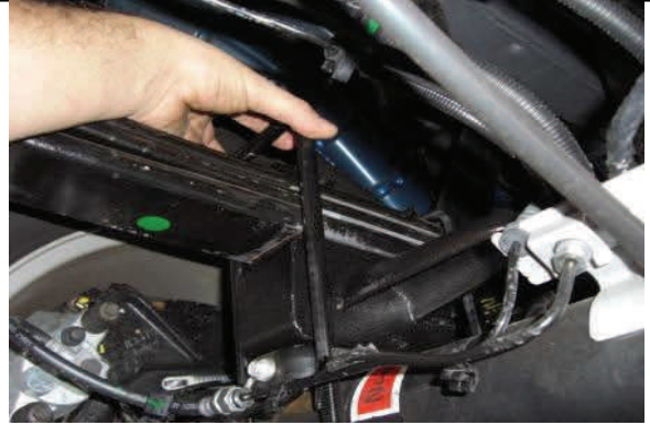
Place new longer u-bolts over leaf spring and axle.