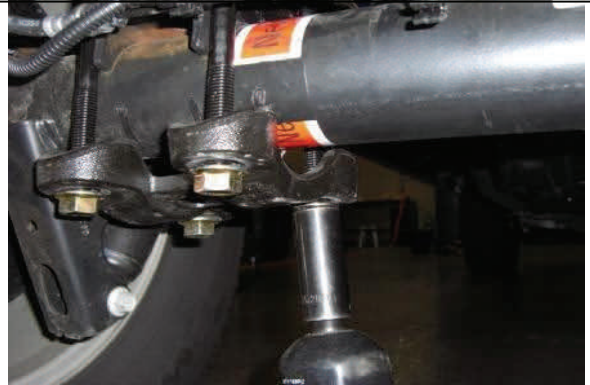
Snug hardware down, lower vehicle on ground and torque.

Recheck all work and test drive. Vehicles with two piece drive shafts may require lowering of the carrier bearing with spacers.