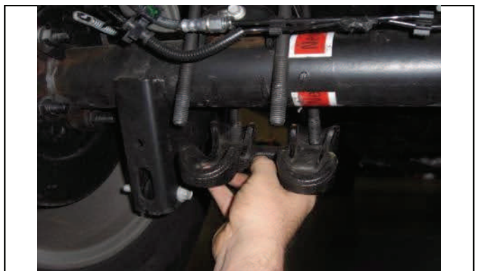
Remove lower u-bolt axle plate.