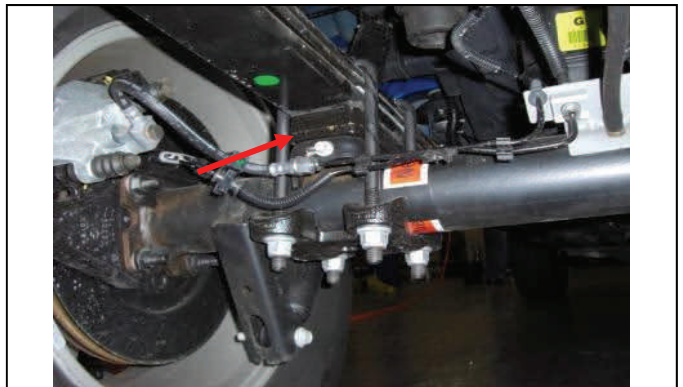
View of 4WD rear axle and leaf spring, note factory block