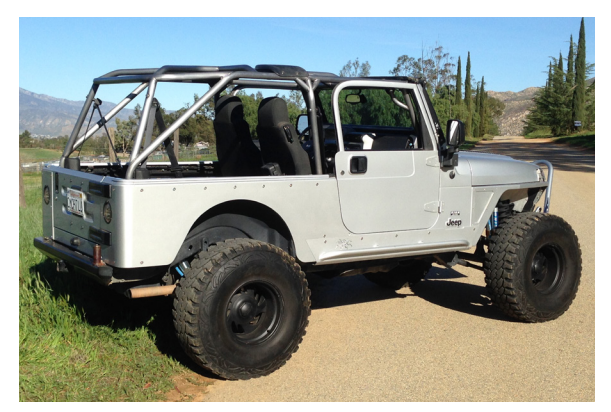
Congratulations, you have completed the installation of your Poison Spyder Full Cage Kit!

42. Re-install the cage into the Jeep and properly tighten all fasteners. Use the supplied 1/2-13 Gr8 hex head cap screws, washer plates and nylon-insert lock nuts to secure the bottom foot of each Lower A-Pillar to the existing hole in the floorboard of the Jeep.