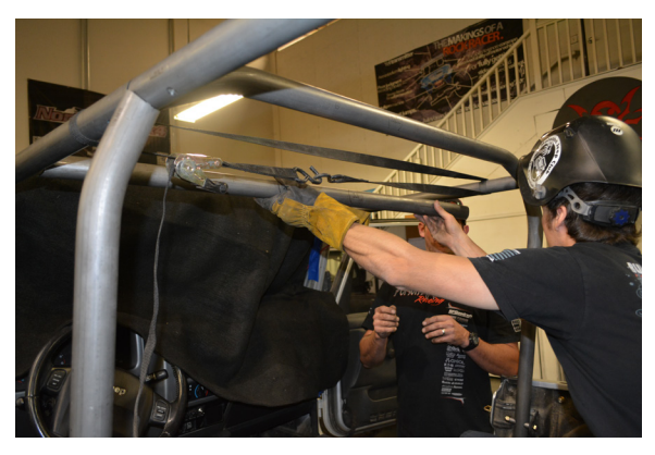
Note that the side of the Header Bar has been laser etched with a guide mark for proper placement of the A-Crossbar.

22. Set the A-Crossbar (1) in place, spanning between the two Header Bars, toward the front, near the windshield.