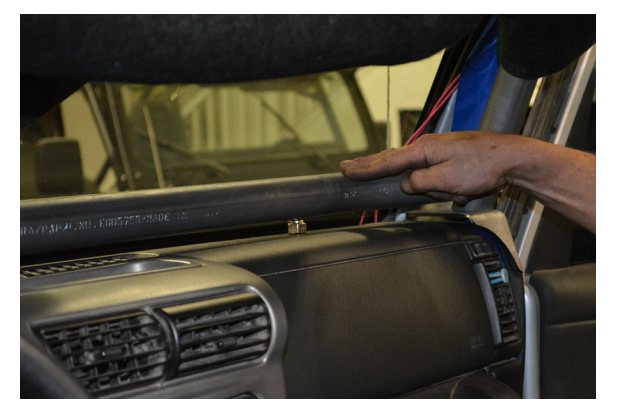
With all three pieces (both Upper A-Pillar Tubes and the Dash Bar) positioned, tack them into place.

underside of the Header Bar, however the lower end of the Upper A-Pillar Tube is not marked on the top of the Lower A-Pillar plate piece. The way they fit into the notched ends of the Dash Bar will determine the position of the lower ends of the Upper A-Pillar Tube. Use a couple of 1/2" hex nuts, set on top of the dash, to space the Dash Bar above the dash.