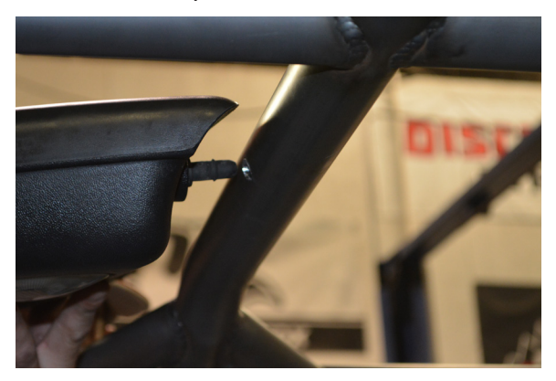
Make sure the two bolt holes are correctly marked on the Rear Down Bar, then remove the speaker pod, drill these holes to 7/32" and thread them with a 1/4-20 tap.

which this hole will need to be located slightly differently than the mark on the tube. To solve this, simply mark the tube in the proper hole location, if it is different than the pre-etched mark. Center-punch then drill this hole to 13/32". Make sure the rubber grommet is installed on to the metal tang, and push the sound bar into place.