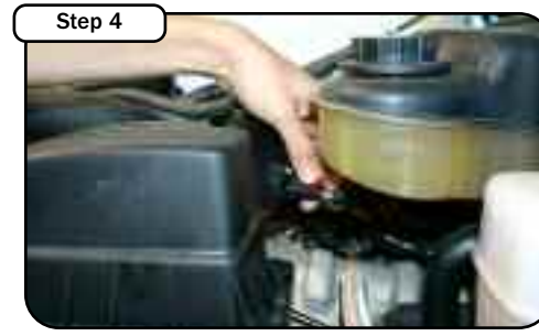
Disconnect the MAF sensor from the back of the air box.