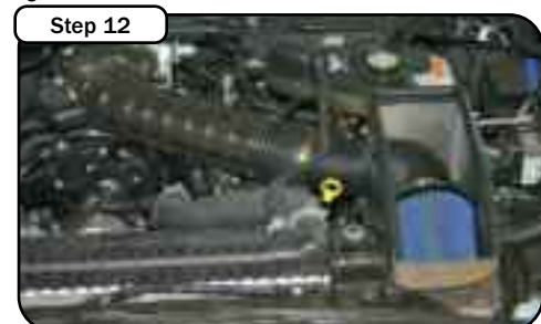
The installation is now complete. Check all electrical connections and tighten all clamps. Periodically check all connections.

NOTE: Retighten all connections after approximately 100-200 miles. Place the included CARB EO sticker on or near the device on a smooth, clean surface. EO identification label is required to pass the smog inspection.