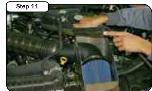
Place the trim seal along the edge of the housing. Start at one end and work your way around the edge.