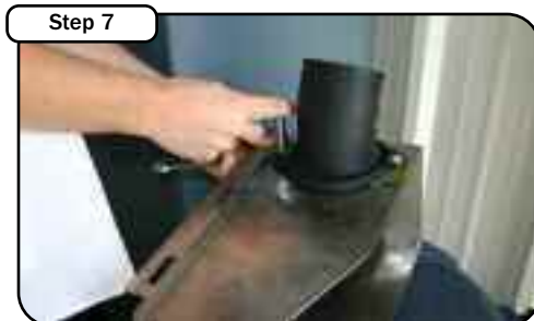
Transfer MAF sensor over to the new intake assembly. Secure unit with supplied MAF pad, nylon spacers and screws. Make sure the arrow on the sensor is pointing in the correct direction