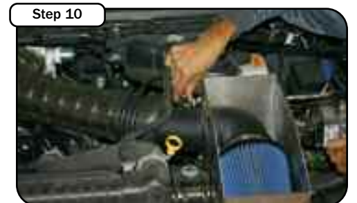
Reconnect the MAF sensor. Fasten the lower air box clips to the new housing.