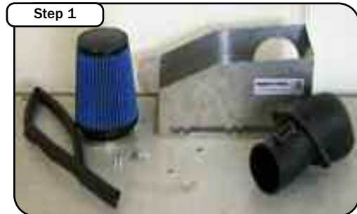
Complete intake system with parts.