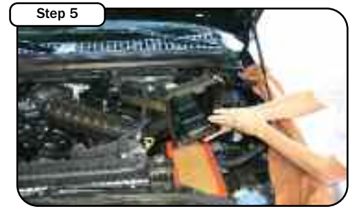
Remove the air box and factory air filter.