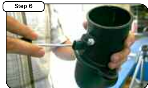
Slide intake tube into the housing. Line up the mounting holes and secure unit with supplied screws and washers.