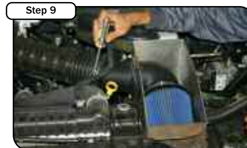
Place assembly into the lower portion of the air box. Tighten the hose clamp on the intake duct.