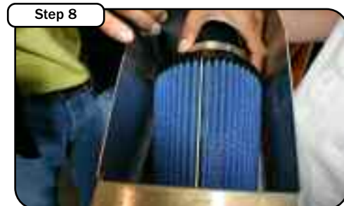
Place pre oiled air filter into the housing. Secure filter with provided clamp.