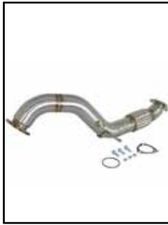
Turbo Middle Race-Pipe

P/N: 48-36606-HC (Street) 48-36606-HN (Race)