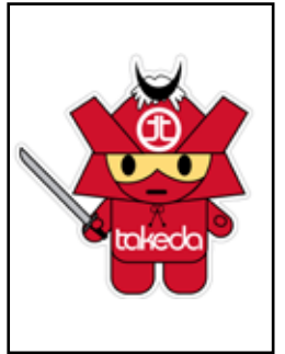
Takeda Mascot Decal