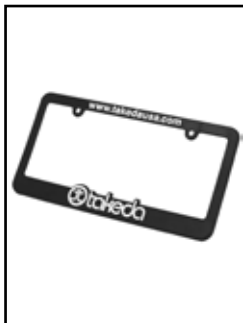
Takeda Lic. Plate Frame