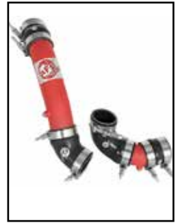
Intercooler Tube Set

P/N: 49-36623-B (Blk. Tips) 49-36623-P (Pol. Tips) 49-36616-L (Blue Tips) 49-36616-C (C/F Tips)