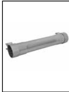
Exhaust Resonator Delete