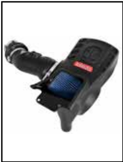
Takeda Momentum Intake