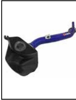
Cold Air Intake System