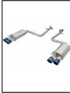
Axle-Back Exhaust System

P/N: 49-36037-P (Pol. Tips) 49-36037-L (Blue Tips)