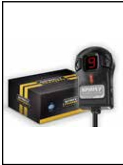
Sprint Booster V3