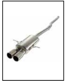
Cat-Back Exhaust System

P/N: 48-36318-HC (Street) 48-36318-HN (Race)