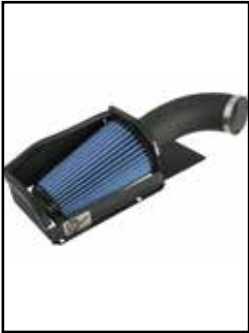
Air Intake System