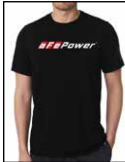
aFe POWER T-Shirt

P/N: 40-30441-B (S) 40-30442-B (M) 40-30443-B (L) 40-30444-B (XL) 40-30445-B (2XL)