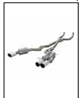
Catback Exhaust Polished Tips