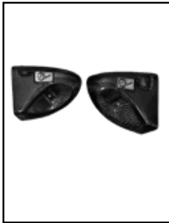
Dynamic Air Scoops