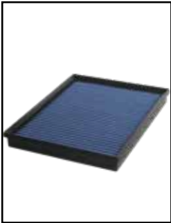
OE Replacement Filter

P/N: 40-30382 (M) P/N: 40-30383 (L) P/N: 40-30384 (XL) P/N: 40-30385 (2XL)