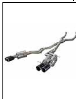
Catback Exhaust Carbon Tips