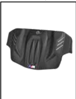
Caron Fiber Engine Cover