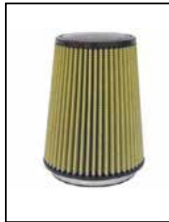
Pro-GUARD 7 Air Filter